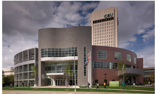
This is a LEED Certified project (LEED BD+C: Schools - LEED Silver 2014)

As with most urban projects, the tightness of the site posed many challenges during construction. Close coordination between the design team, construction manager, City of Cleveland, RTA, and others was critical to successfully blend the new building and site improvements into the fabric of the city. Existing utilities above and below ground required close collaboration with various City departments to allow new utilities to be installed to serve the new building.